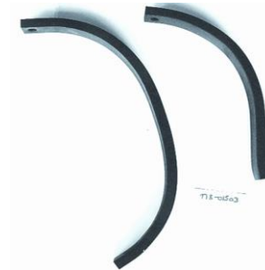
Chisel Plow Tine & Helper