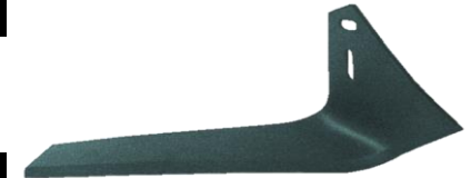
Beet Hoe Blade