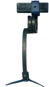
Vert Mount RH