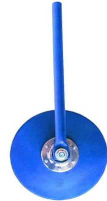
Disc Weeder Assembly