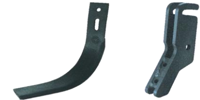
Crescent Hoe & Friction Trip