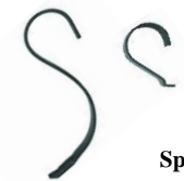
Spring Tine & Helper