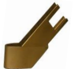
SS2-2 Boot Extension