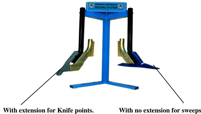
With extension for Knife points.