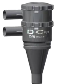
DF210 D-CUP Diffuser Twin hose Inlet set

DF210 D-CUP Diffuser Twin hose Inlet set -NO mount clamp assy. Including one new extension body clamp set.