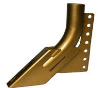
SS2-1 Delivery Boot