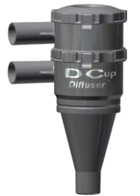
DF210 D-CUP Diffuser Twin hose Inlet set

DF210 D-CUP Diffuser Twin hose Inlet set -NO mount clamp assy. Including one new extension body clamp set.