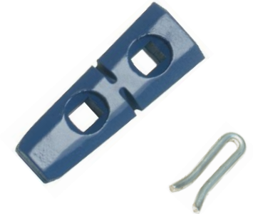
Cast Wedge & Retaining clip