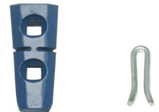
Cast Wedge & Retaining clip