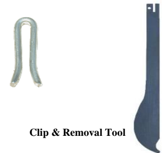
Clip & Removal Tool